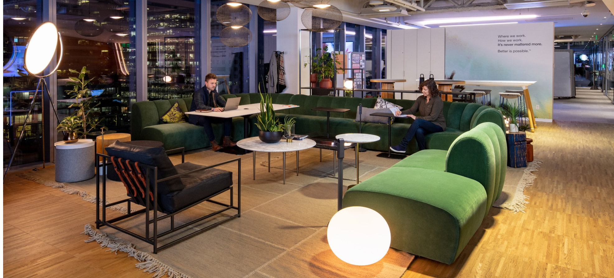
Boston Worklife