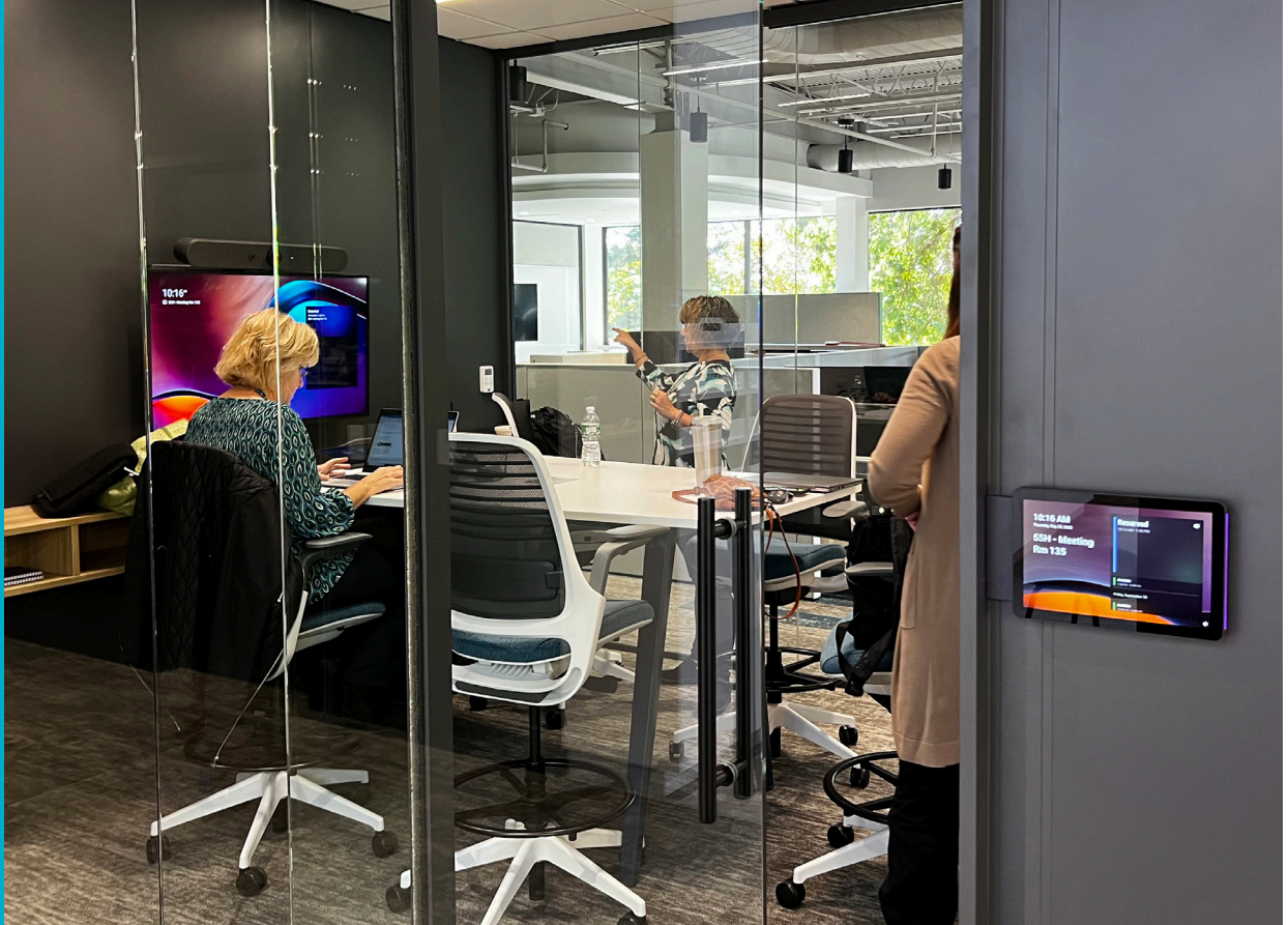
Workplace Innovation Hub | © Red Thread