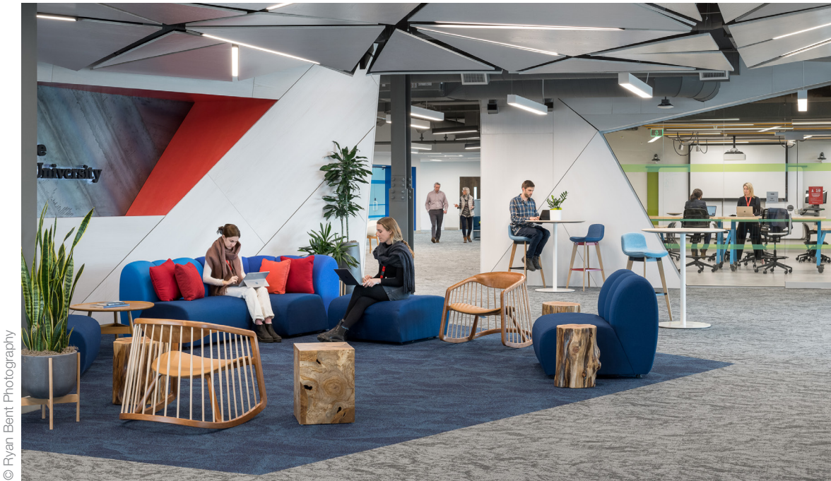
Renovated Arsenal Yards fuels upcoming Watertown neighborhood.