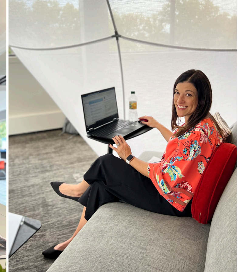
Workplace Innovation Hub | © Red Thread