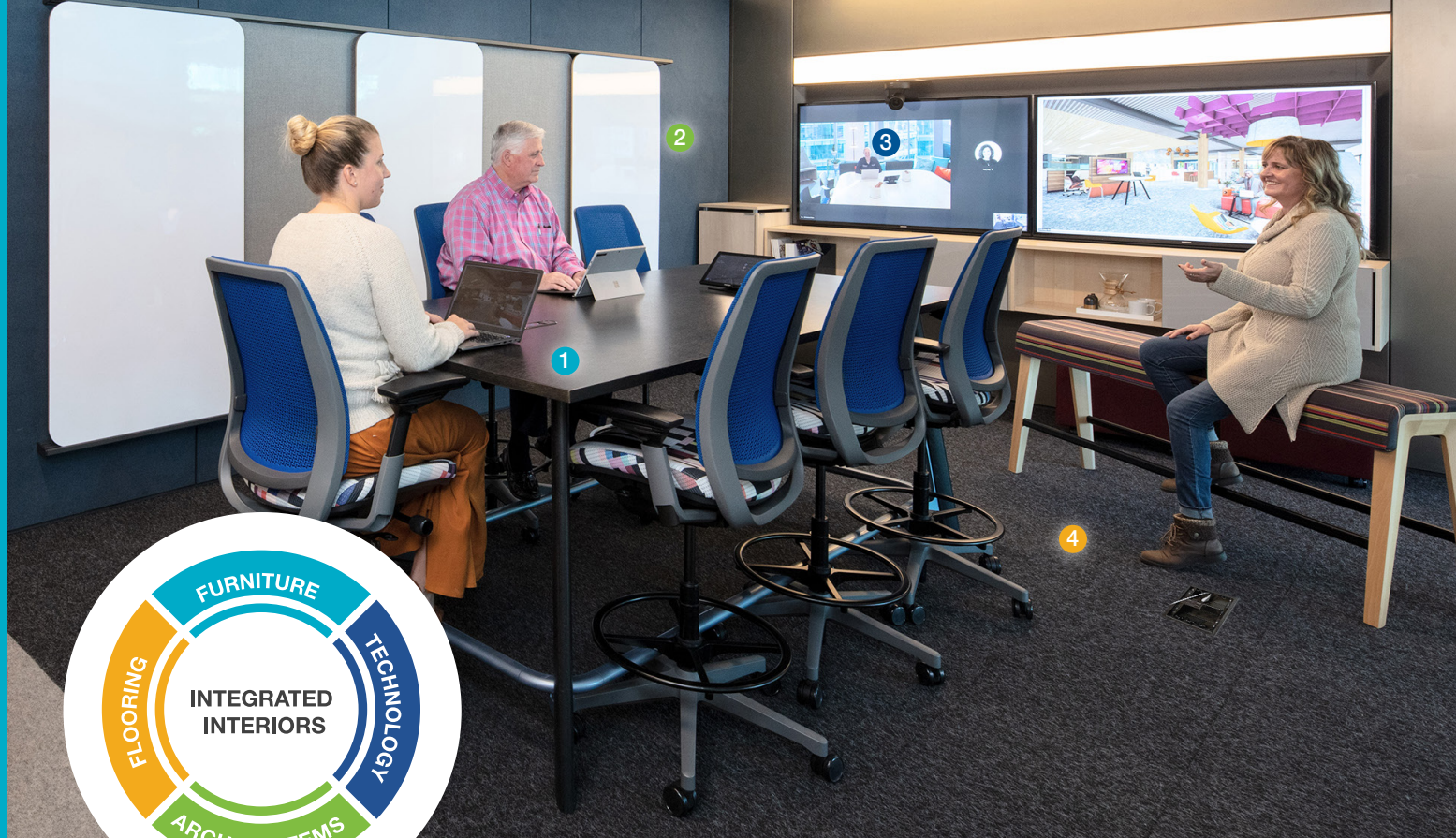
Boston WorkLife