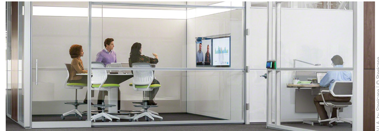
V.I.A. by Steelcase