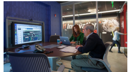
Audiovisual | Technology