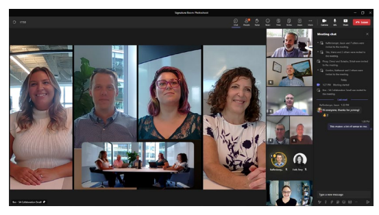
Logitech Sight Camera remote view