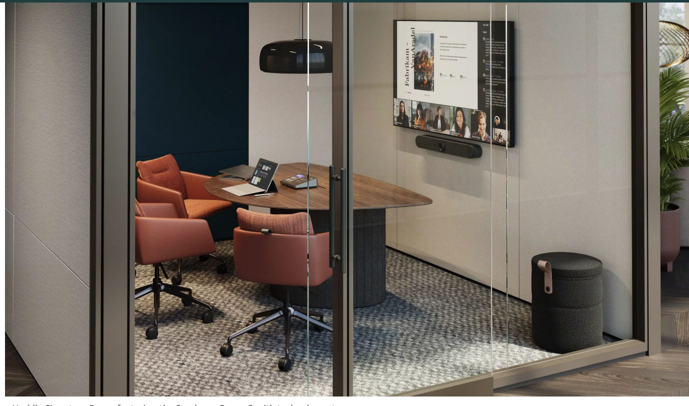
Huddle Signature Room featuring the Steelcase Coupe 3 with technology storage