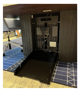
Built-in Rack Storage