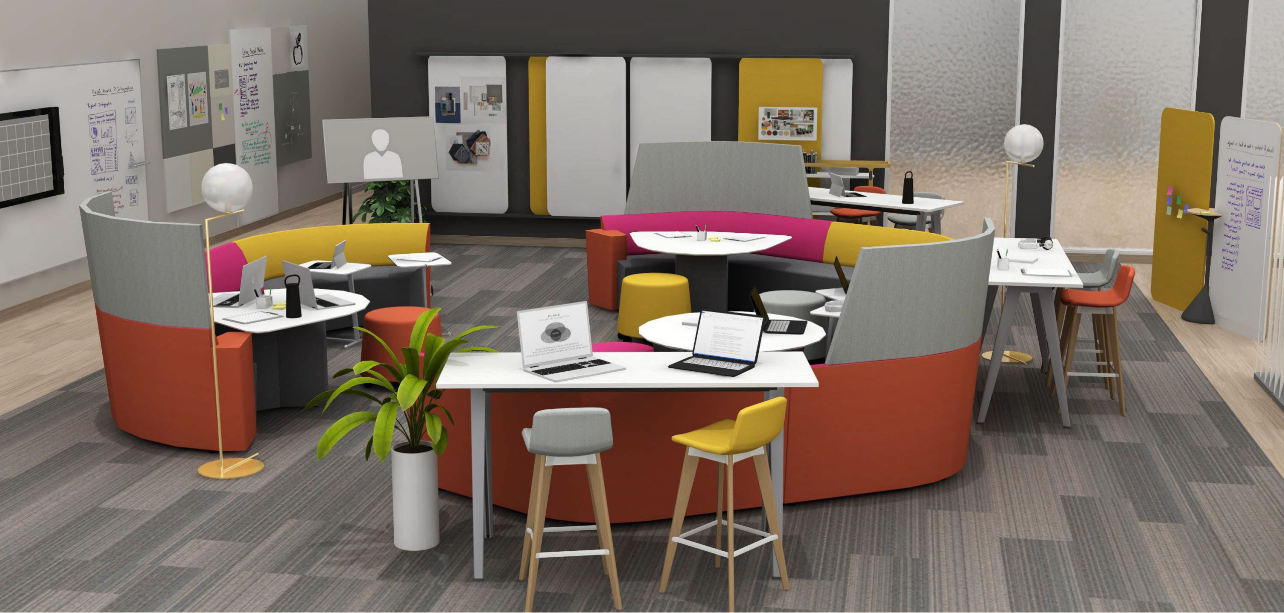
Away From The Desk | Cubb Seating | B-Free Table | Flex Markerboards | Flex Screens | Fflow