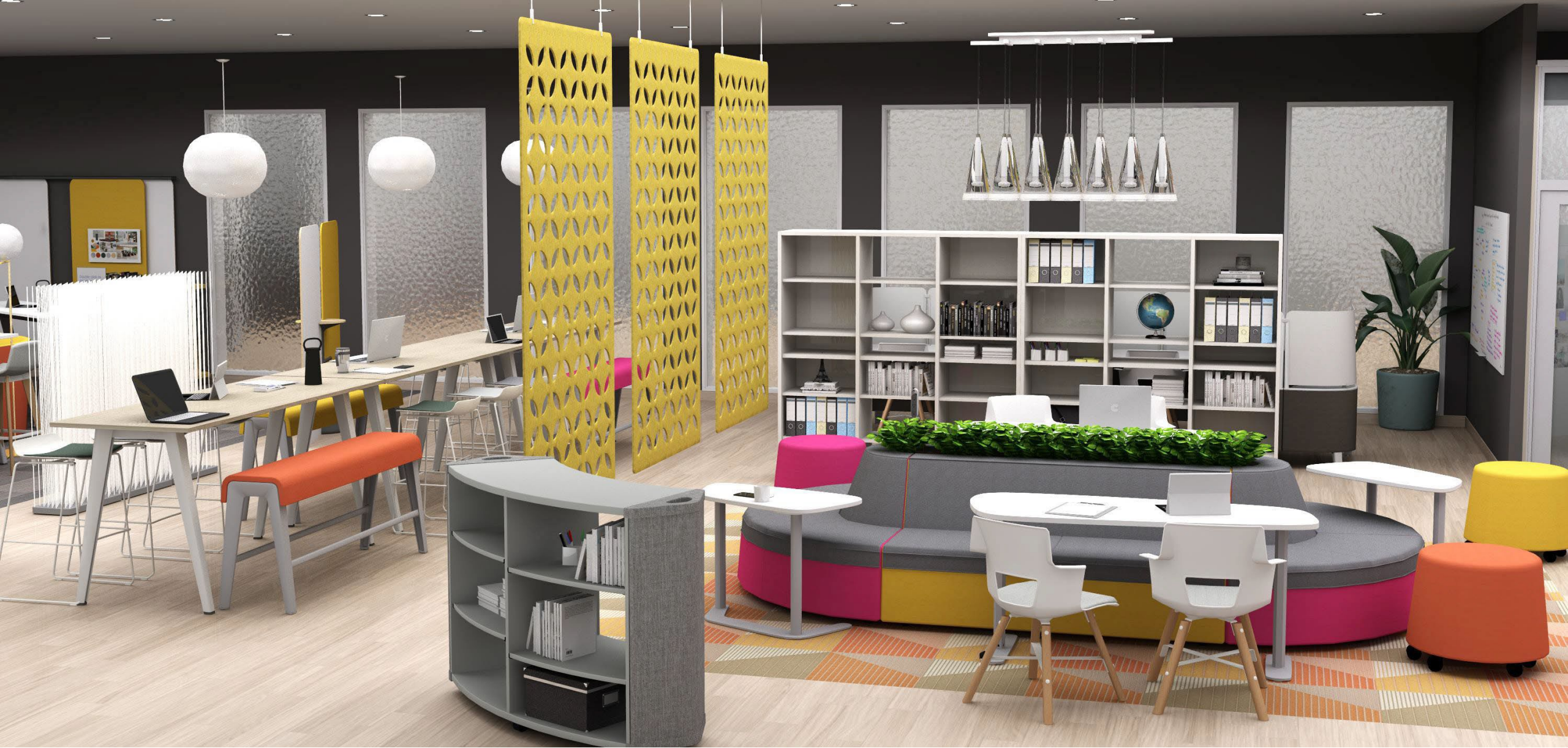
Campfire Lounge | Shortcut | Flowform Storage | Elbrook Tables | Sully | B-Free Beam | B-Free Tables