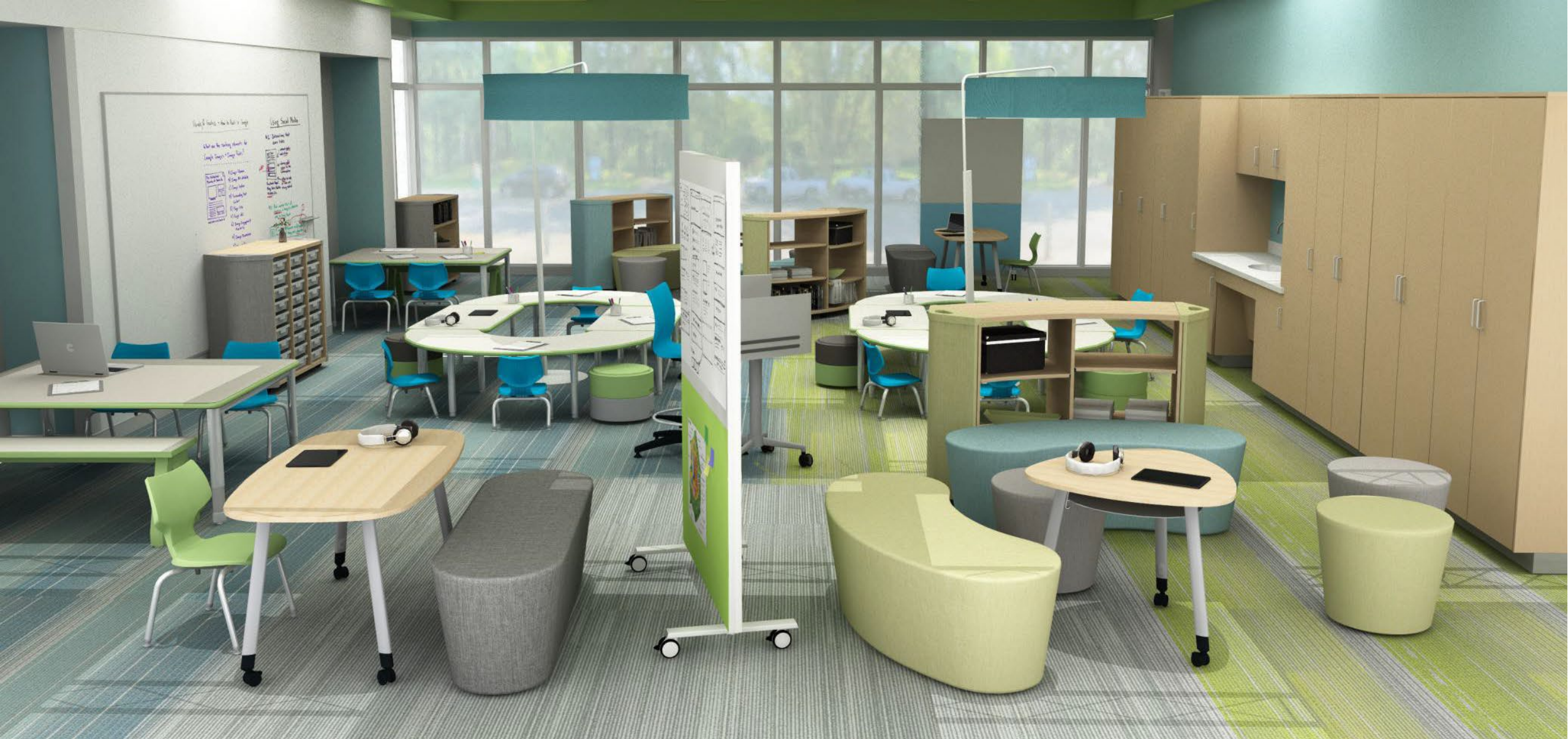
Flowform Seating | Groove | Orbit Tables | Planner Activity Table | Planner Studio | Polyvision Textura | Flowform Storage