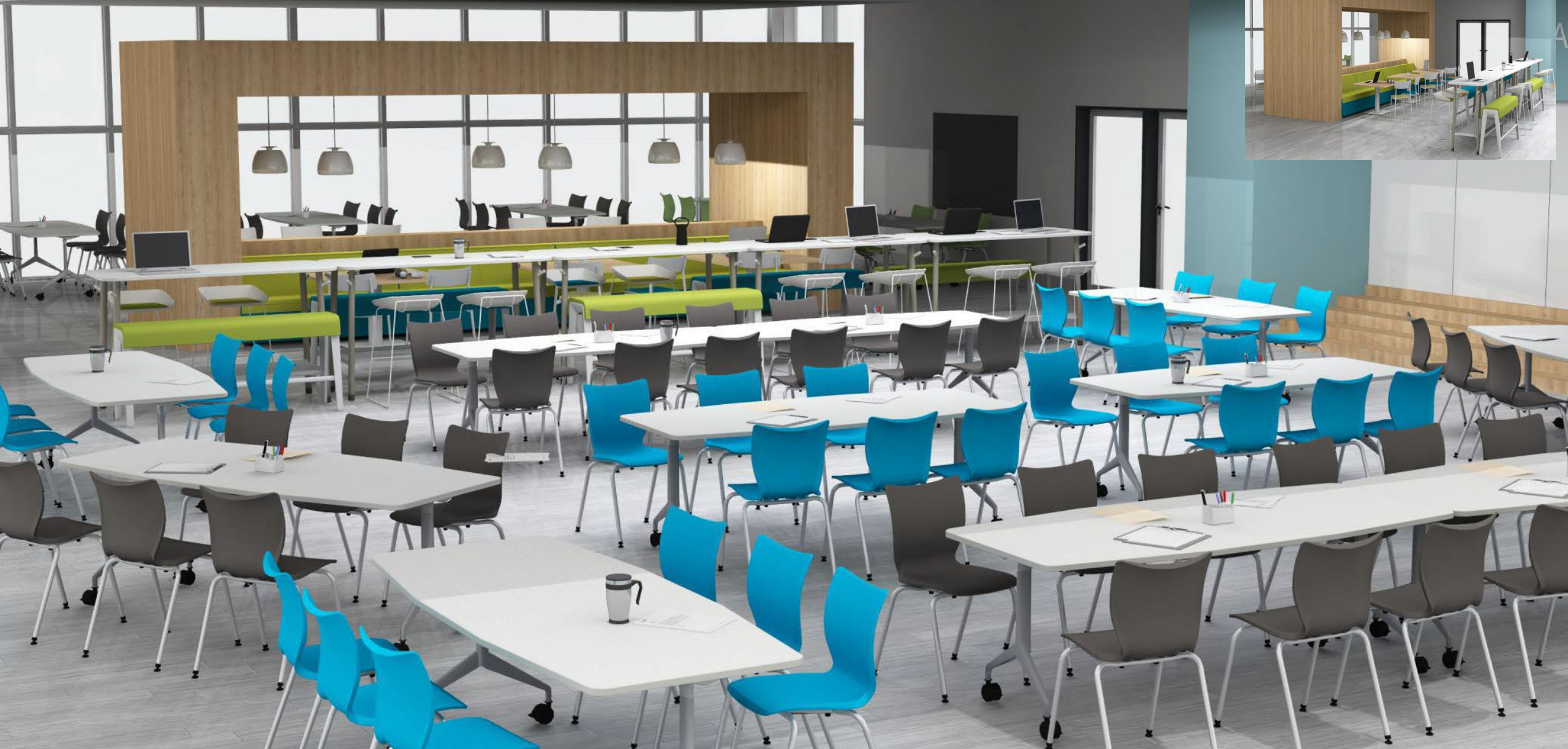
Groove Stack Chair | Verb Flip Top Team Table | Flex Work Table | Scoop | Campfire Lounge

BUDGET PRICE: $80,651.00 Please contact us for additional discounting.