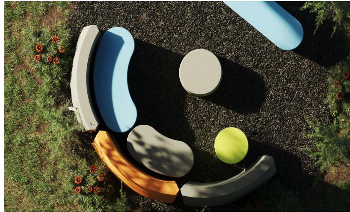
TenJam Amped Chairs and Side Tables, Drift Seating, UFO stacking stools, Rad pad disks