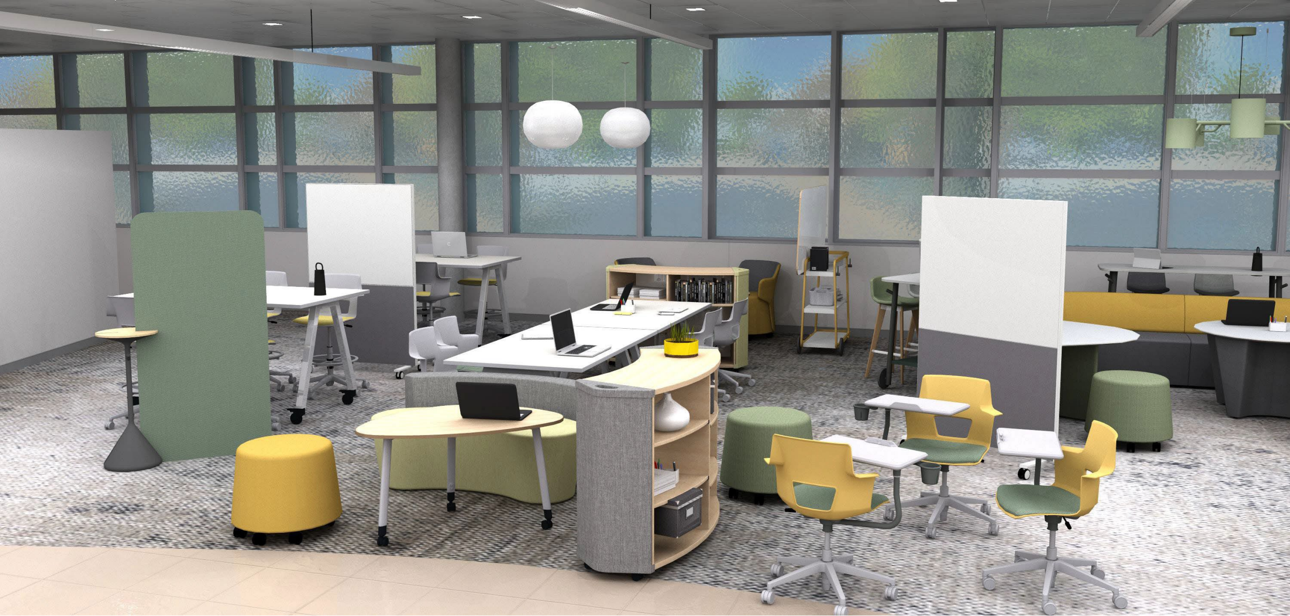
Freeform Storage | Orbit Table | Sully | Freeform Seating | Shortcut with worksurface