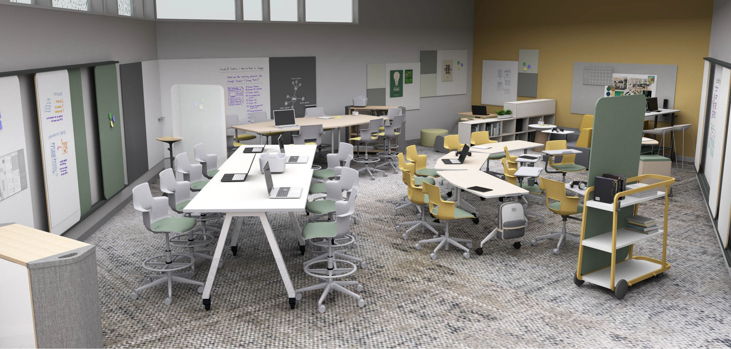
Planner Studio Tables | Shortcut | Flex Rail with Markerboard and Screens | Flip Top Tables