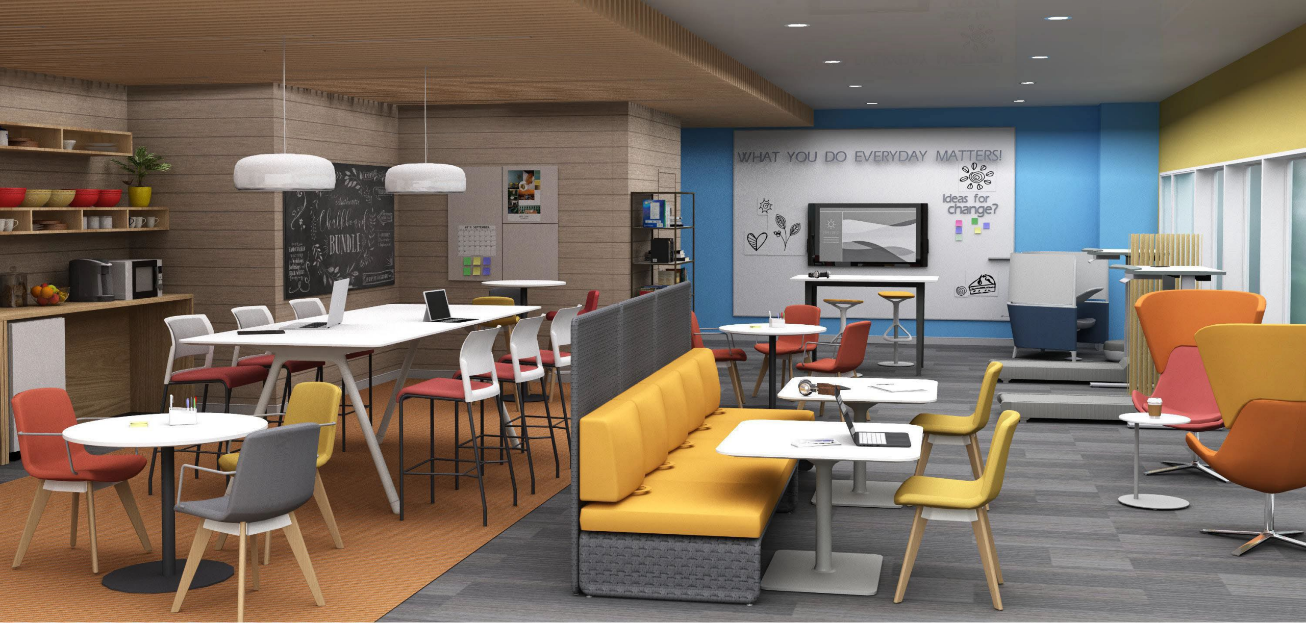
Cubb | Move | Lox | Avi Lounge | Montara650 | Potrero415 | B-Free Table | Brody | Lagunitas Lounge | Walkstation