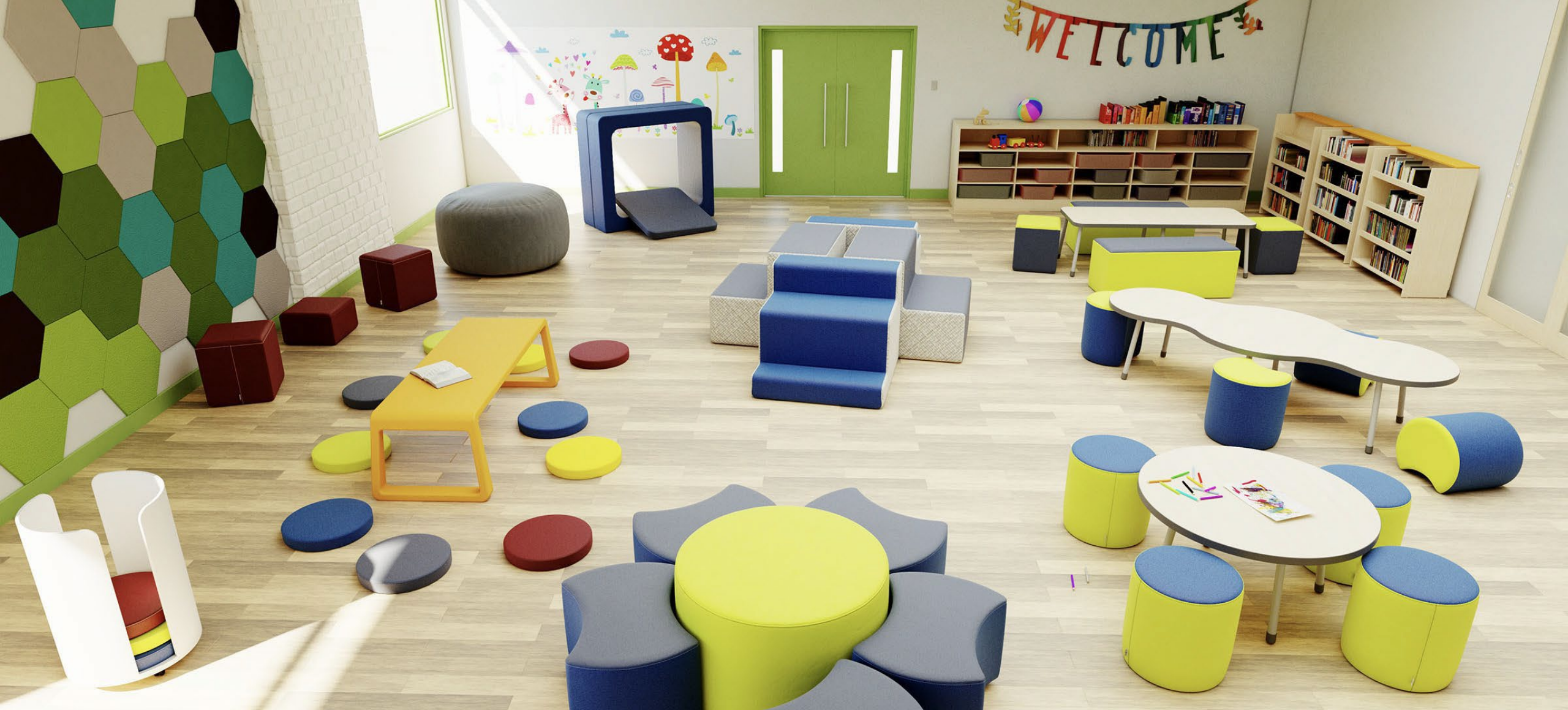
Fomcore Lily pads, Lily cart, 4' FOM bag, Ottoman, Bench, Bowtie Combo, Diamond ottoman, Step Series, Robin's nest

BUDGET PRICE: $38,334.00 Please contact us for additional discounting