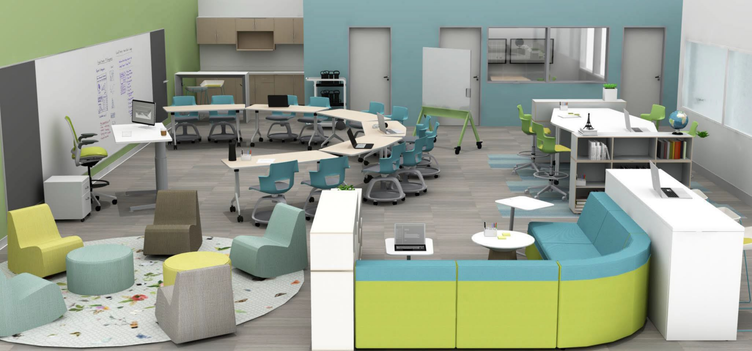
Soft Rocker | Campfire Lounge | Verb Chevron Flip Top | Shortcut Tripod Base | Verb Trapezoid Table | Shortcut Stool | Bivi Depot | Planner Whiteboard

BUDGET PRICE: $47,186.00 Please contact us for additional discounting