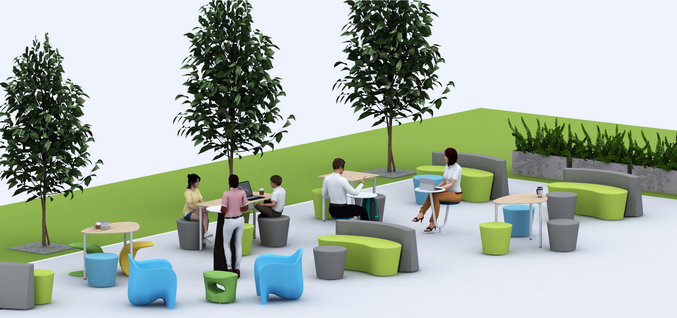
Smith System Flowform Outdoor Seating and Tables, Tenam Amped Chairs and Side Tables, Drift Seating, Viccarbi Burin Standing table, solar swivel chair/table