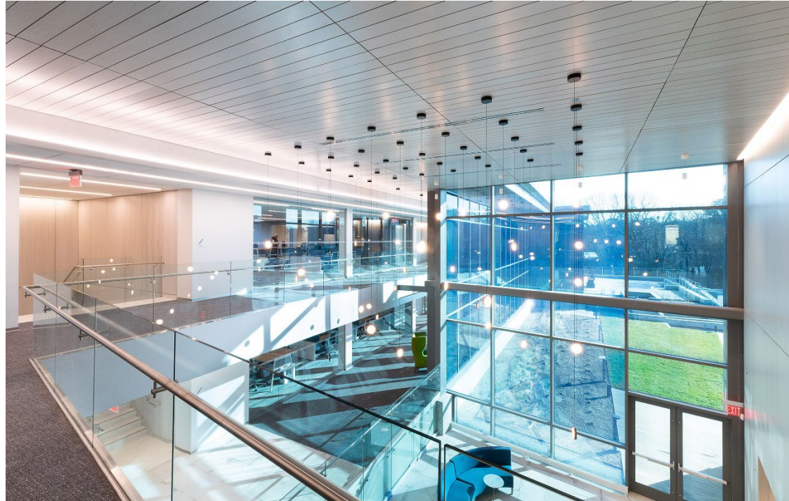
Great Hall

Cape Cod 5's new 80,000 s.f. headquarters, HQ5, on Route 132 in the Town of Barnstable represents their investment in and commitment to the region they serve – Cape Cod the Islands and Southeastern Massachusetts. The campus is a physical representation of their Green Initiative and corporate “Five Ways” of community engagement – community banking, responsible business practices, corporate leadership and volunteerism, advancement of financial know-how, and philanthropy. HQ5 consolidated field offices for 300 employees to create a central hub that thoughtfully integrates key cultural aspects such as sustainability and collaboration through technology.