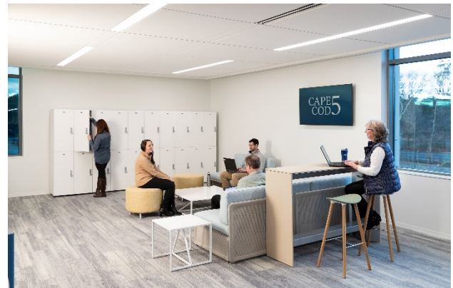
Workspace Collaboration Area

The Steelcase Room Wizard maximizes productivity and space utilization by allowing employees to schedule rooms in advance or ad-hoc without waiting for a meeting room. The five-way divisible conference center also optimizes real estate by configuring spaces to accommodate meetings, trainings, and large town hall gatherings on the fly.