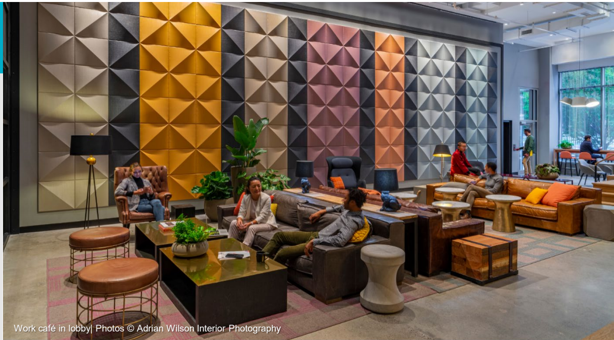
Work café in lobby