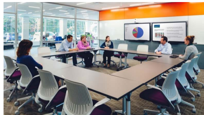
Conference room with technology

Town & Country looked to Red Thread for the knowledge, expertise and capabilities required to create a holistic workplace. The flexible infrastructure, featuring V.I.A. demountable walls, carpet tiles and flat wire can be easily reconfigured to accommodate change and future growth. The furniture solutions encourage a variety of individual and collaborative work modes. Technology applications supporting digital content display, videoconferencing and room management were thoughtfully incorporated as well. A Red Thread Project Director coordinated all teams and decisions and provided a single point of accountability from selections through installation.