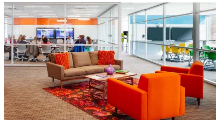
Ecosystem of spaces, demountable walls