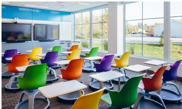
Learn lab with Node chairs